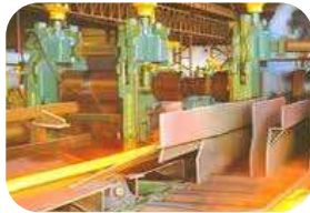
Bar Rolling Mill