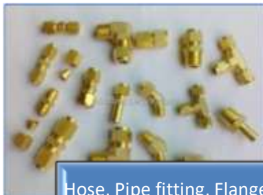
Hose, Pipe fitting, Flanges