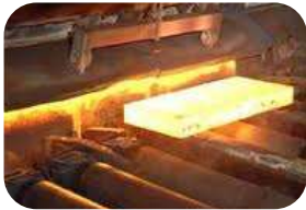
Plate Rolling Mill