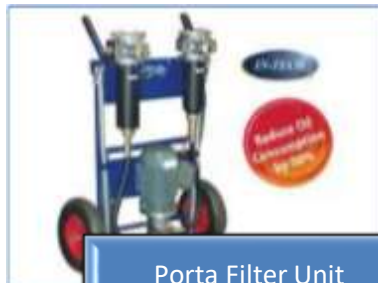
Porta Filter Unit