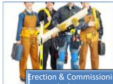
Erection & Commissioning Assistance